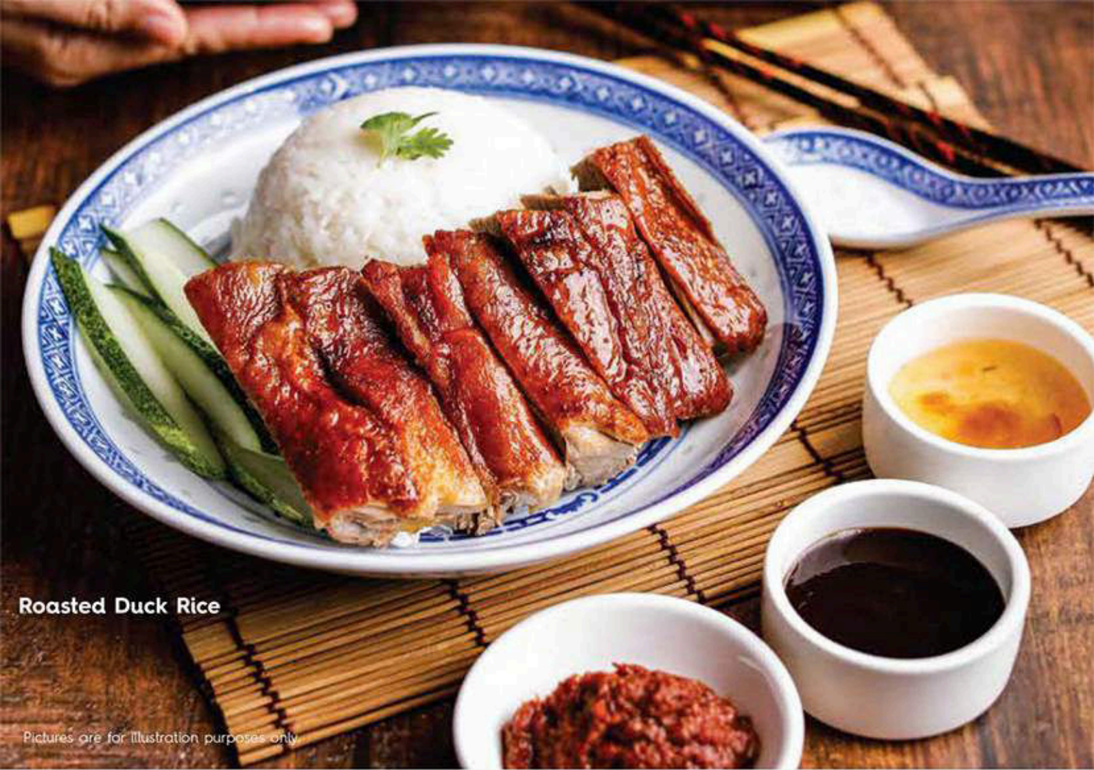
Roasted Duck Rice

Pictures are for illustration purposes only