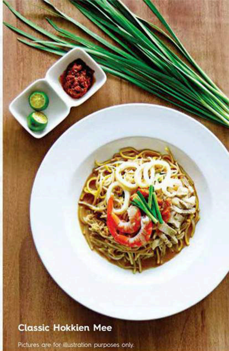
Classic Hokkien Mee

Pictures are for illustration purposes only.